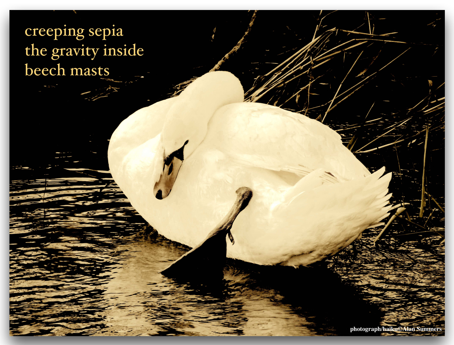
A mute swan on the River Avon, Chippenham, Wiltshire, England UK

Beech Mast is the fruit of the beech tree and in the abundant 'Mast' years the trees produce literally millions of small, edible triangular nuts.