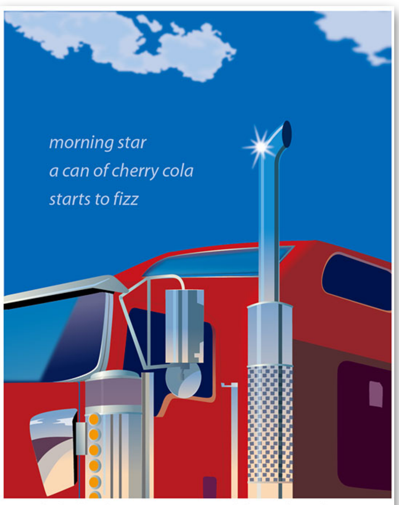
haiku by Alan Summers artwork by Kuniharu Shimizu